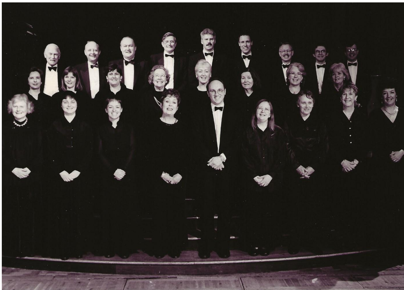
St Peter's Singers at St Paul's Hammersmith, 16 March 1997